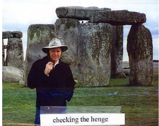
checking the henge