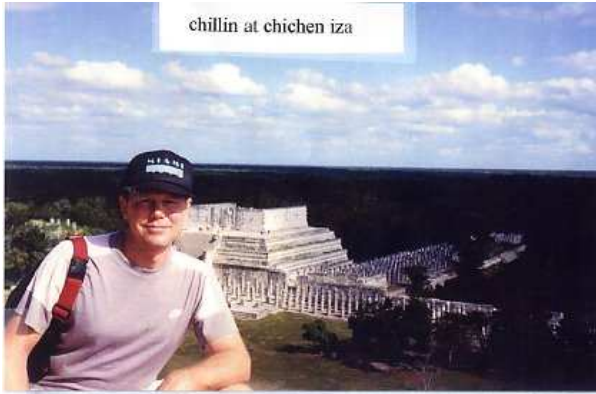
chillin at chichen iza