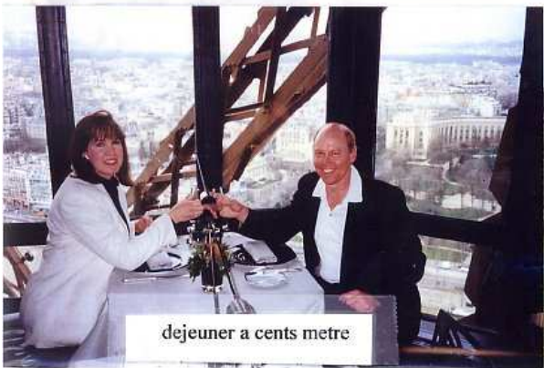
dejeuner a cents metre